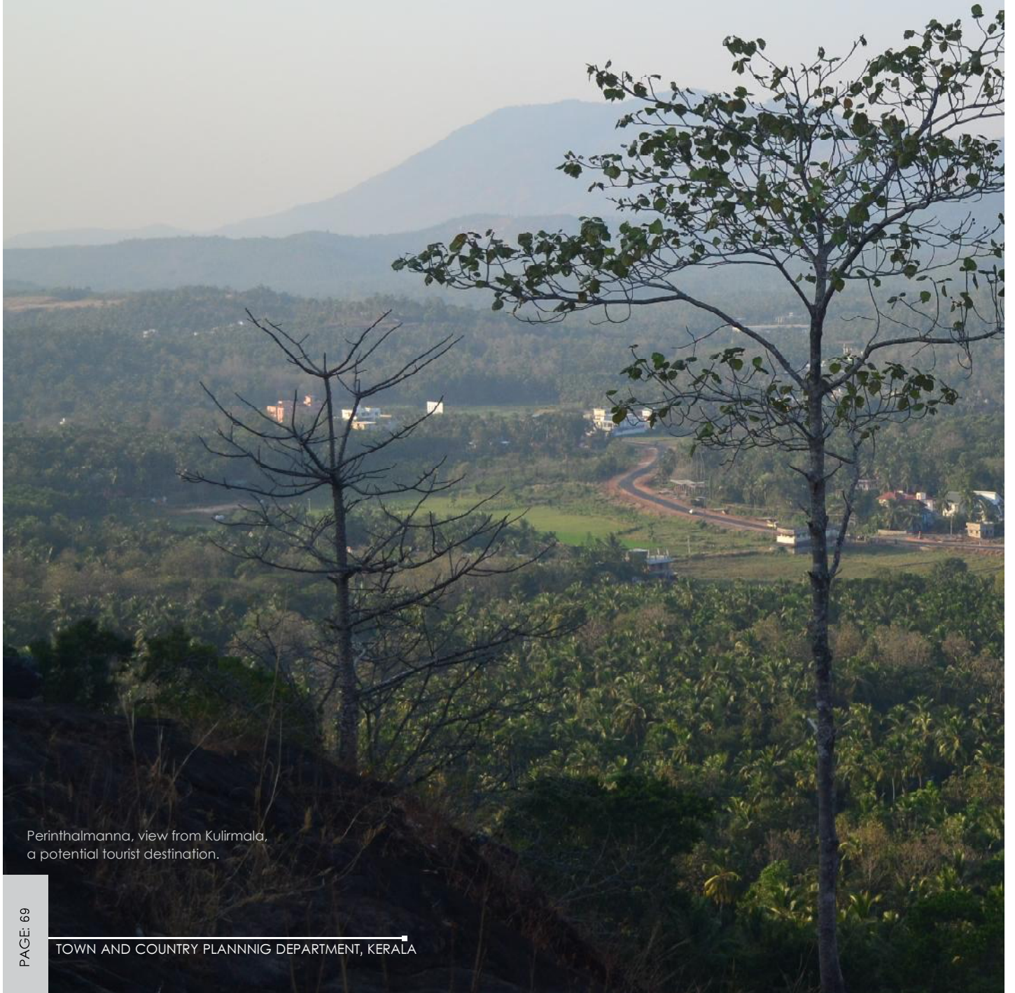
Perinthalmanna, view from Kulirmala, a potential tourist destination.